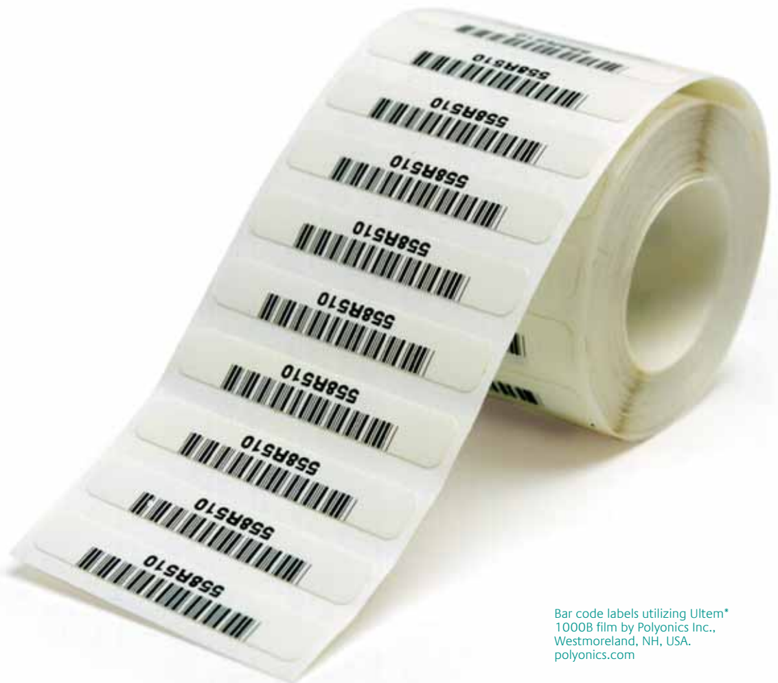
Bar code labels utilizing Ultem® 1000B film by Polyonics Inc., Westmoreland, NH, USA. polyonics.com

Hands-on engineering support for customers covers the numerous aspects of application development: from design reviews, prototyping and testing, to thermoforming, injection molding and in-mold decoration (IMD).